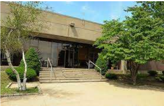
Water Treatment Plant