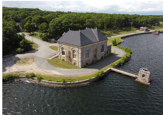
1873 Treatment Plant